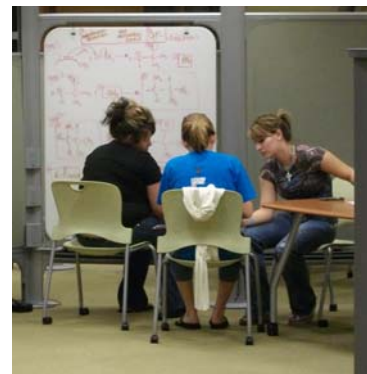
Students enjoy working in their new spaces.

Since the changes were made, there are more users in both buildings. The result is that it is also noisier. In response, the Library has installed additional "Quiet Study Zone" signs on the upper floors in both libraries and is periodically having staff check noise levels on all floors. The changes to the student work and study spaces in both libraries have had a positive impact, and we thank our users for providing us with input needed to do the job right.—David Baldwin, Library Administration