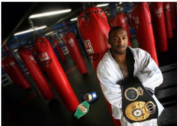
Las Cruces boxer Austin Trout is ranked No. 2 in the world WBA rankings.

By Bill Knight / El Paso Times Posted: 11/11/2009 11:27:39 PM MST